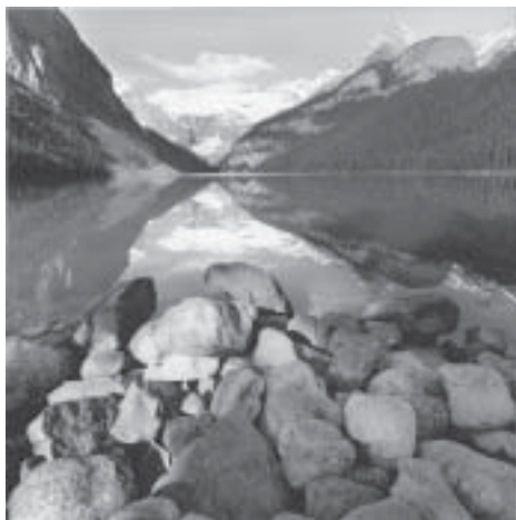
Lake Louise, Canada, 2000. Gelatin silver print. Collection of the photographer.