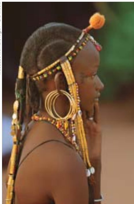
Wodaabe Woman, Niger.

10 Eric Meola—The Last Places on Earth Photographs and text by Eric Meola